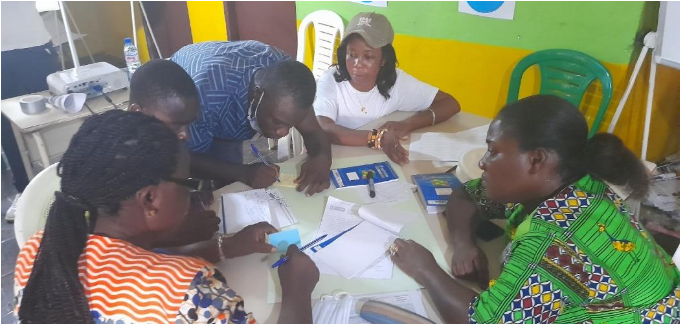
Figure 2: Table discussion on perspective about children