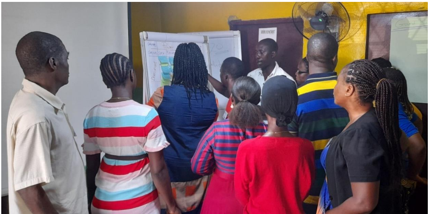
Figure 3: Group discussion on power and privilege