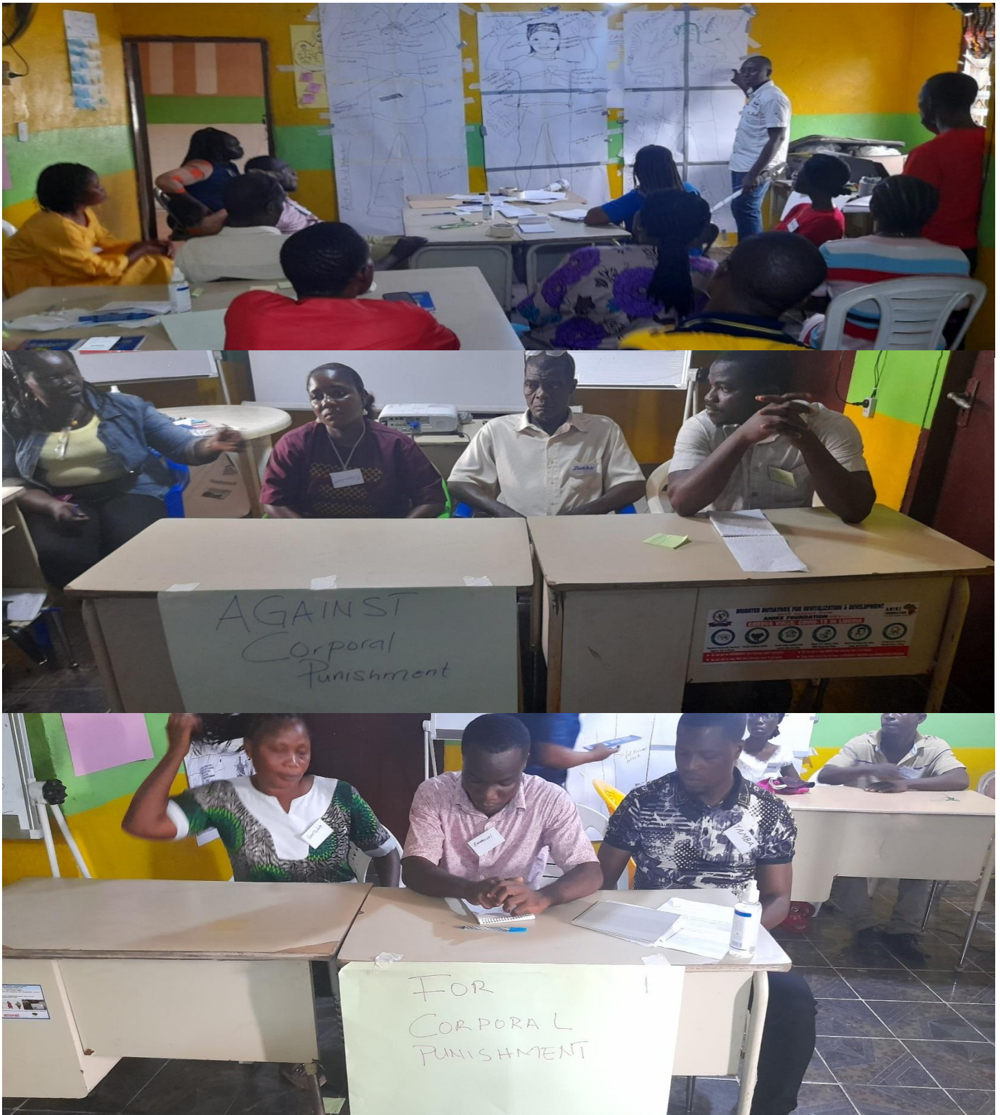
Figure 5: Debate on Corporal Punishment