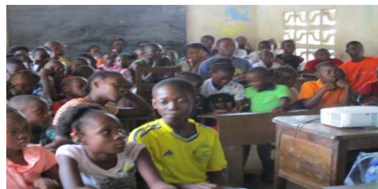
Students seated as the presenter presents, 2019