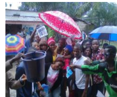
Participants handover sanitary Materials to families in Chicken Soup Factory

In January to early February 2019, we conducted awareness on children internet usage with a one day workshop on the danger of the cyber space; Safer Internet Day (SID). The campaign's slogan was, " Together for a better internet ". It was called action for all stakeholders to join together and play their part in creating a better internet for everyone, and especially for younger users. BIRD-Liberia in partnership with the Child Online Africa invited two elementary schools to participate; Bethany A. G. Mission School and the LeoArthur Early Learning Foundation . We had hundreds of student participating in the workshop. They learned how to use the internet and the danger it pose to their early life. They learned that cyber space keeps every information place on it.