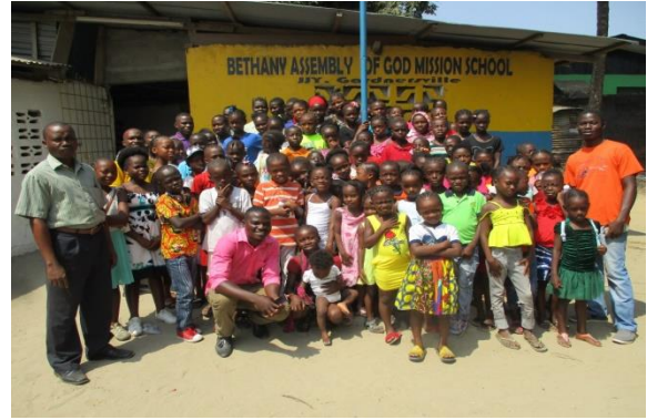
Facilitator, school administrators, organizational leaders and students stands for group pictures