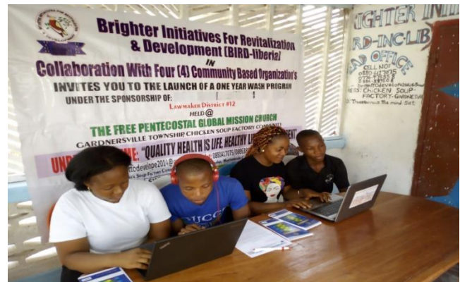
BIRD-Liberia Multi-Youth educational empowerment program in Monrovia-Liberia