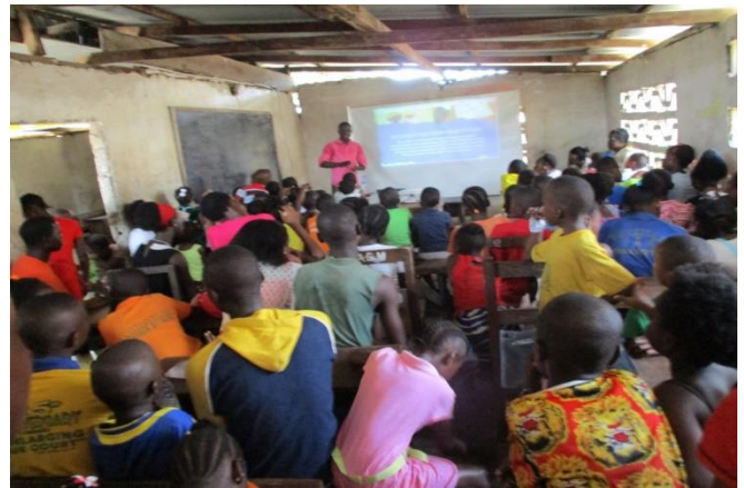
The Facilitator answer participant's questions

Safer Internet Day (SID) is organized by the insafe network of Safer Internet Centers (on behalf of the European Commission) in February of each year to promote safer and more responsible use of online technology and mobile phones, especially among children and young people across the world. Although the campaign originally started in Europe back in 2004, it has grown year on year since that time, and was celebrated in more than 140 countries in 2019.