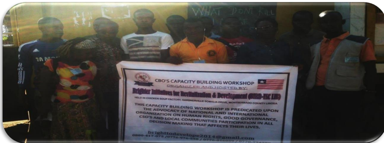
Community Base Organization Capacity Building workshops, 2017

We also conducted CBO workshops to build their capacity of their leaders in leadership. See photo for your view