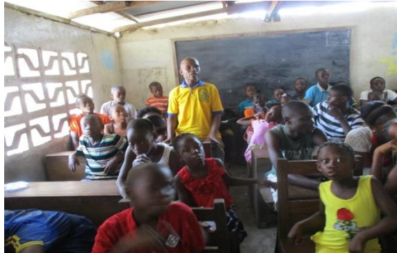
Participants asked questions

The Safer Internet Day celebrations was organized as one of the platforms we can use to engage across board in a discussion around the issue of how to protect our devices, information and how to involve our families to learn, explore and interact online. This gives us a very impactful participation of children in Liberia. Children learned how to use the internet in a safer way at the end of the workshop.