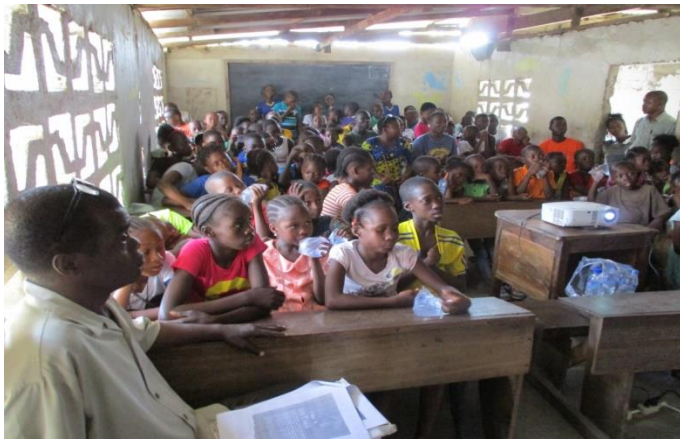
Program Officer takes note on participants concerns