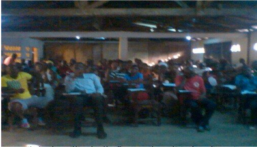
Above are community leaders sitting for the Community participatory discussion on policy issues affecting them in 2017.

In 2018 we conducted community sanitation awareness and promotion in the Chicken Soup Factory Community for 3 months. We also distributed sanitation prevention, promotion and hands on materials to household families. The funding came from community stakeholders and Hon. Richmond Anderson then district 12 representative of Montserrado County, Liberia.